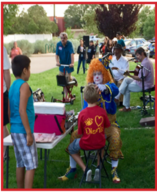
National Night Out had food, events, games and face painting for children.