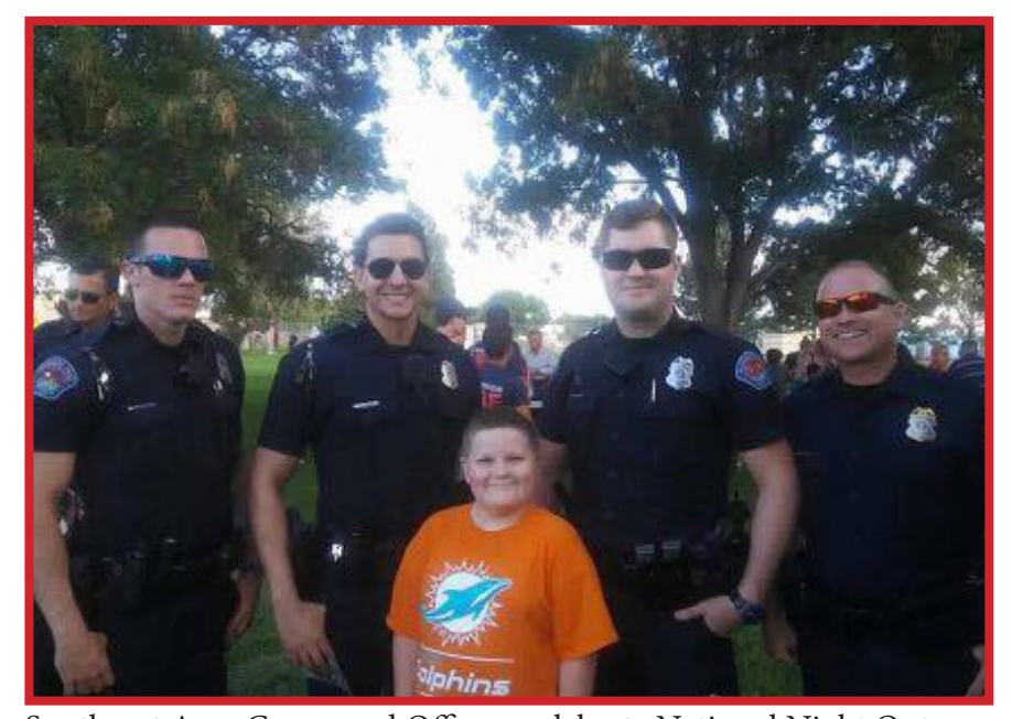
Southeast Area Command Officers celebrate National Night Out.