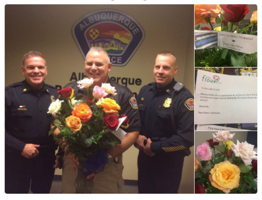
Follow us for more great stories and updates!!

Thanks @standtrue4blue1 for our #ThankfulThursday present. They are beautiful. Men like getting flowers too.