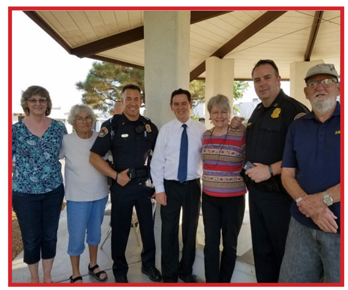
Ladera Heights Neighborhood Association and Northwest Area Command officers at National Night Out.

APD celebrated National Night Out on August 1st which is an annual community-building campaign that promotes police-neighborhood partnerships. National Night Out is a proactive police event that brings law enforcement and the community together under positive circumstances. APD participated in several community activities ranging from small neighborhood gatherings to large events with music and games. APD officers took the opportunity to discuss quality of life issues with residents that affect their neighborhoods, as well as encouraging them to become actively involved.